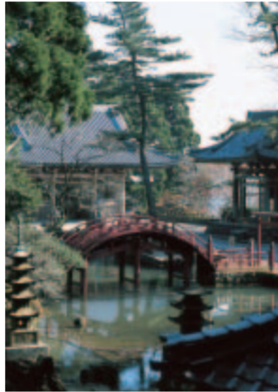
Arched Bridge at Kongo Shoji Temple