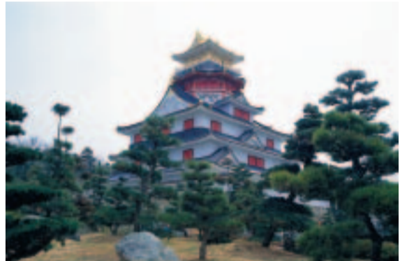
Ise azuchi-momoyama bunkamura