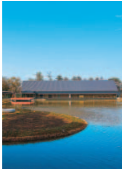
Magata Pond with irises