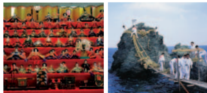
Chinasama-meguri in Futami